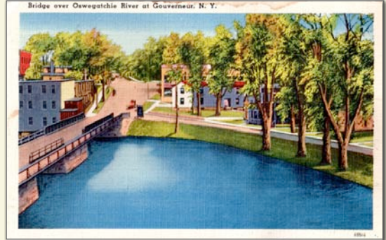
Bridge over Oswegatchie River at Gouverneur, N. Y.