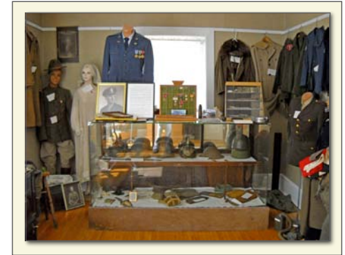
The Military Room honors those who have served our community and our country.

Unraveling history's story takes patient investigation and the ability to ask the right questions. What might seem to be just a "dusty old thing" might tell us something unexpected about the people who owned and loved that object when it was brand new and shiny.