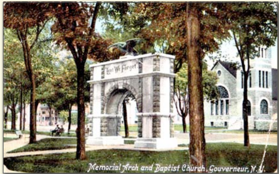
Memorial Arch and Baptist Church, Gouverneur, N. Y.